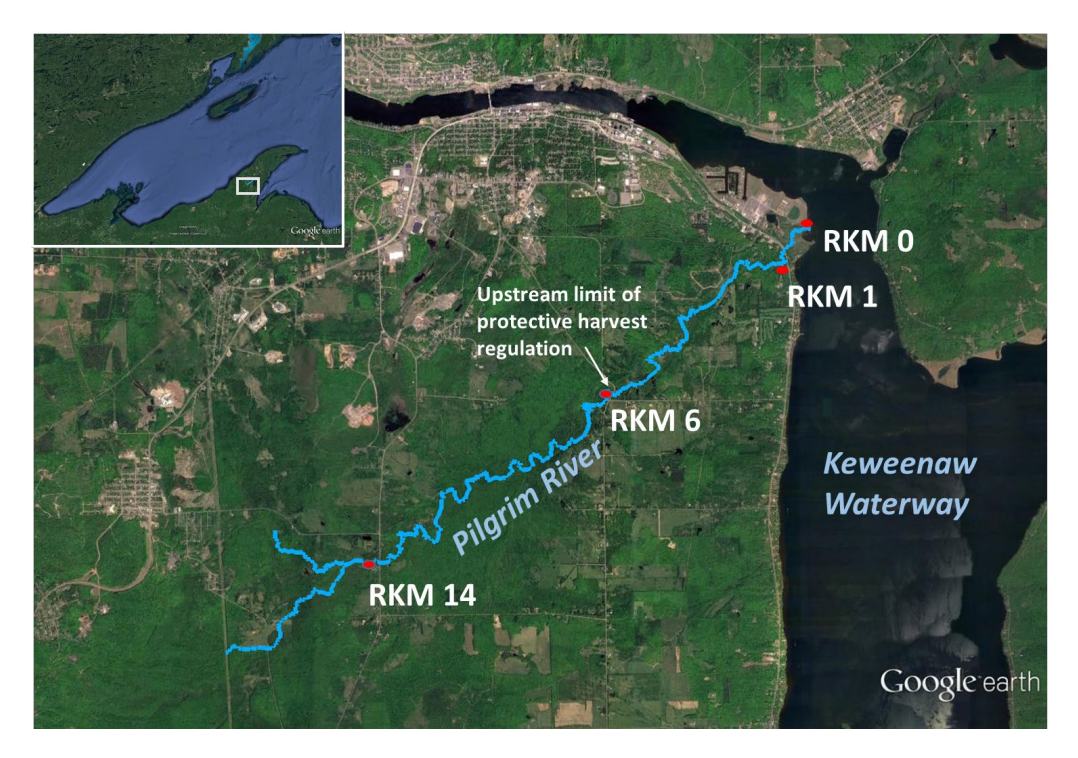
Figure 1 . Map of Pilgrim River in Houghton County, Michigan. Red dots indicate locations where PIT tag antenna stations have been installed.

Seasonal movement and survival probabilities will be estimated using a multi-state mark-recapture model. Three states (reaches) are defined as upstream unprotected reach, downstream protected reach, and Keweenaw Waterway. Tagged fish will be assigned to one of those reaches based on their encounter at a detection station or physical recapture during each season (Figure 2). The resulting capture history matrix will be inputted into Program Mark to build a multi-state mark-recapture model that uses maximum likelihood methods to estimate the probability of movement between reaches and survival in each reach during each season. Akaike's Information Criterion will be used to compare models where survival and movement parameters are constrained across time intervals and/or locations to select the most parsimonious model to be used for parameter estimation.